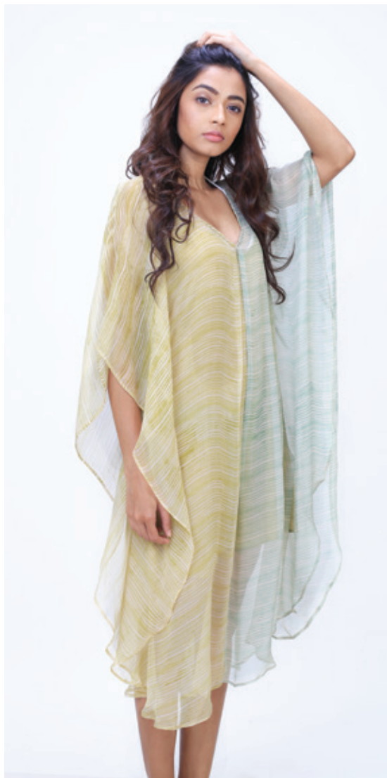
Ref: Block Stripes 03K Color: Green Sizes: S, M, L