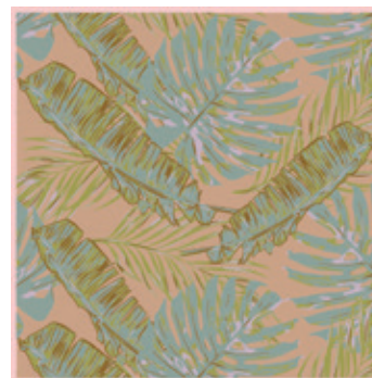
Ref : Chuchu 03J Color : Off white Size : S, M, L