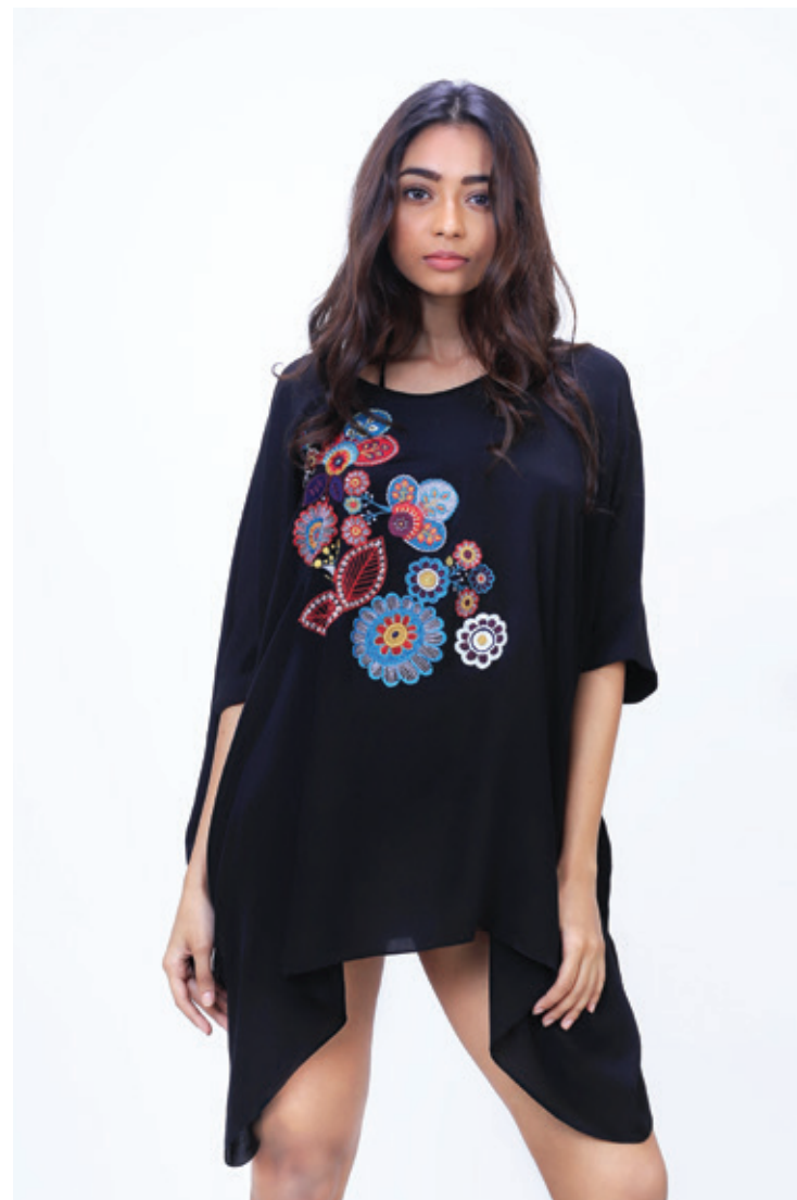
Ref: Orchid 01T Color: Black Sizes: S, M, L