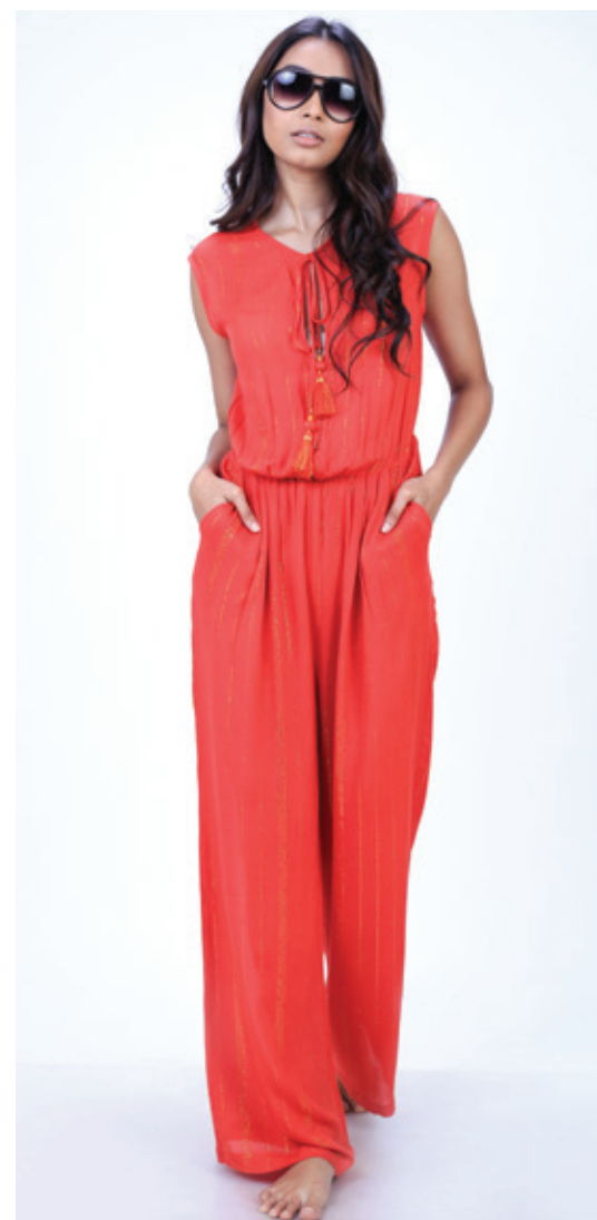
Ref: Lurex 04J Color: Red Sizes: S, M, L