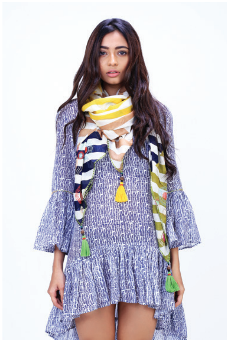
Ref: Block Circle 01D Color: Blue Sizes: S, M, L