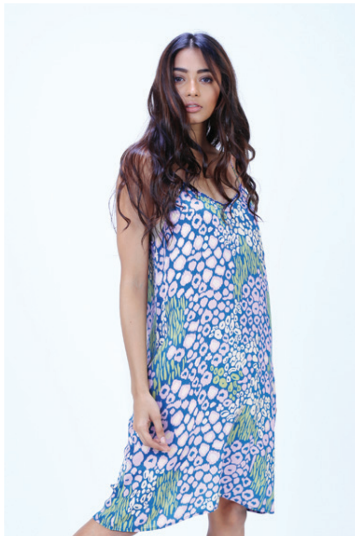
Ref: Leopard 01D Color: Lilac Sizes: S, M, L