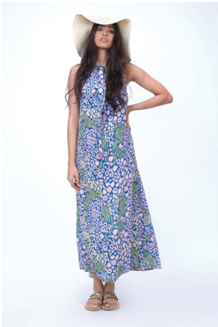
Ref: Leopard 01HD Color: Lilac Sizes: S, M, L