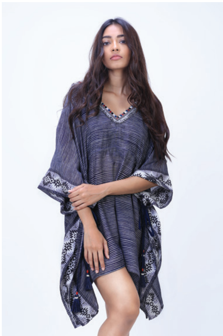
Ref: Ikat 01K Color: Navy Sizes: S, M, L