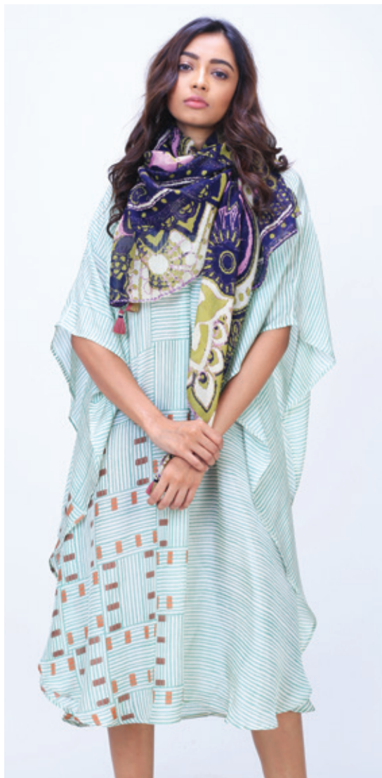
Ref: Block Tribal 03K Color: Green Sizes: Free Size