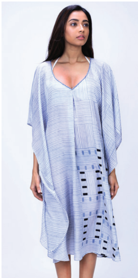
Ref: Block Tribal 02K Color: Turquoise Sizes: Free Size