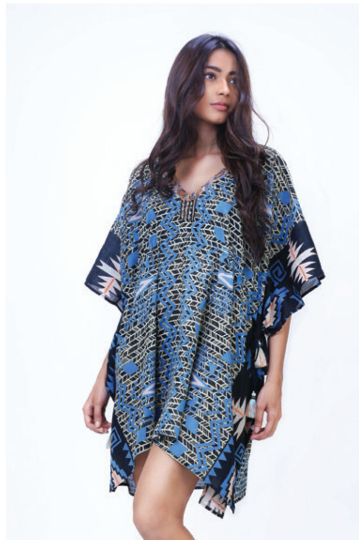
Ref: Mohawk 03K Color: Black Sizes: S, M, L