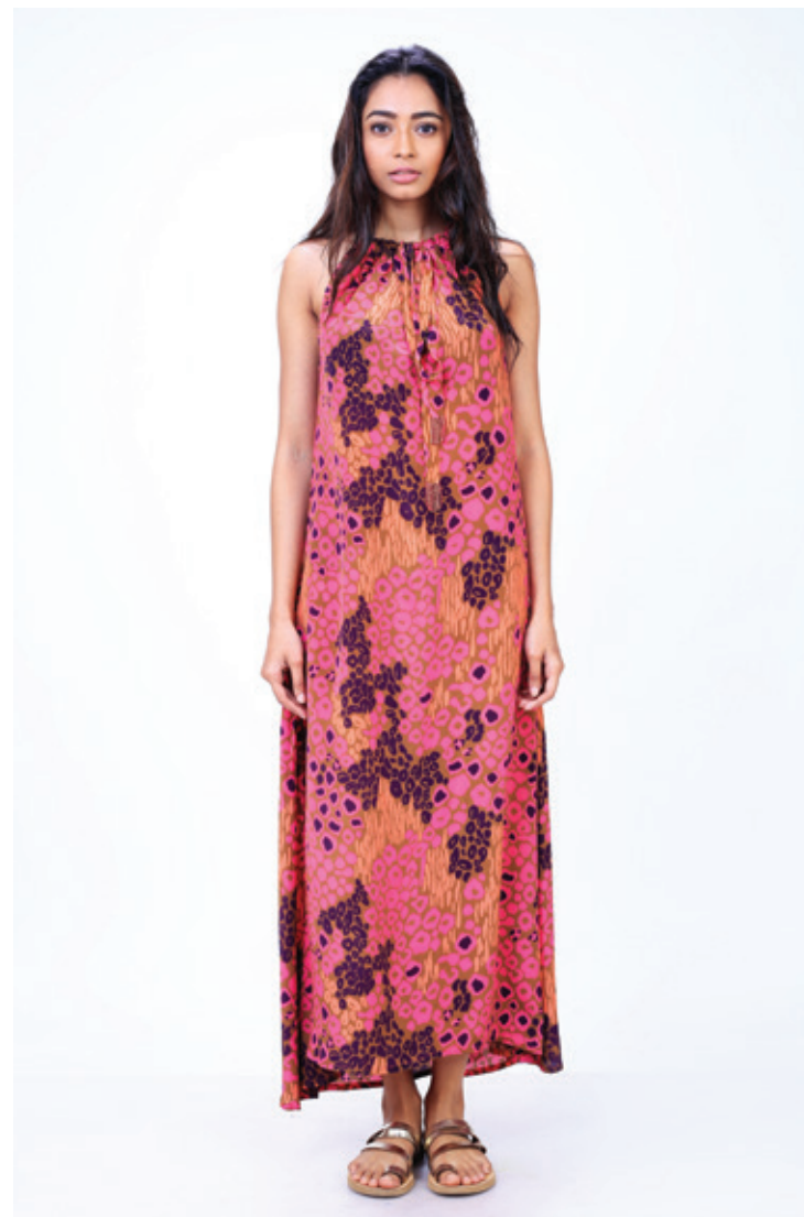
Ref: Leopard 03HD Color: Pink Sizes: S, M, L