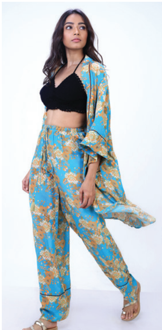
Kimono Pant Ref: Vintage Ref: Vintage Floral 03KM Floral 03P Color: Blue Color: Blue Sizes: Free Size Sizes: S, M, L