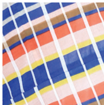
Ref: Stripe 01SK Color: Blue Sizes: S, M, L