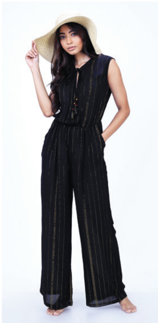
Ref: Lurex 01J Color: Black Sizes: S, M, L