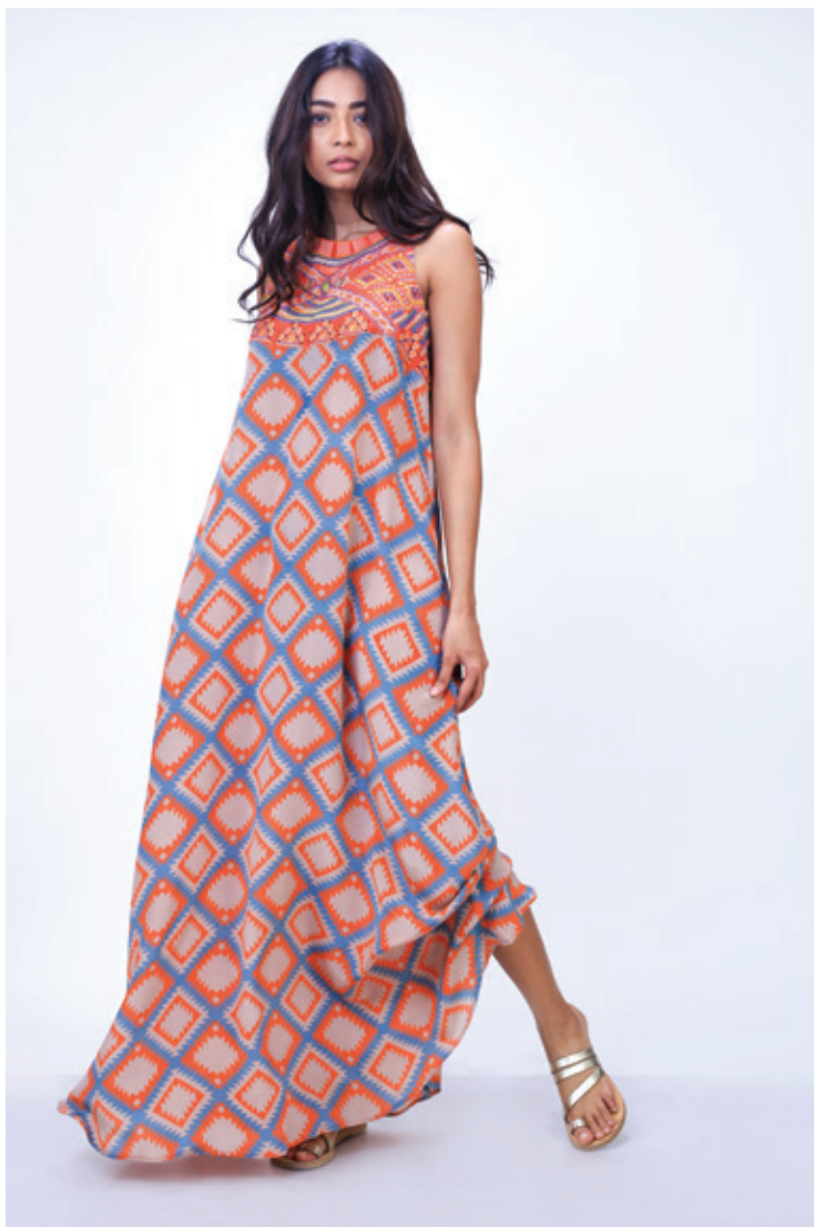
Ref: Aztec 01MD Color: Orange Blue Sizes: S, M, L