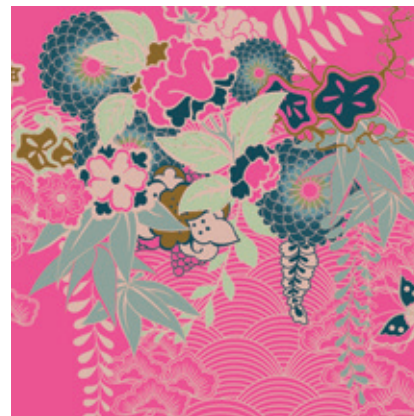
Ref: Meadow 02SP Color: Pink Sizes: S, M, L