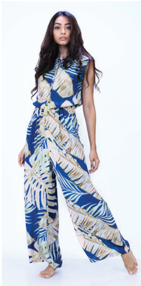
Ref: Chuchu 01J Color: Blue Sizes: S, M, L