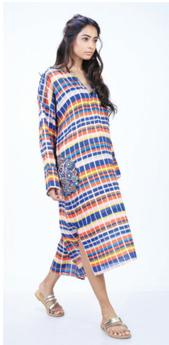
Ref: Stripe 01LK Color: Blue Sizes: S, M, L