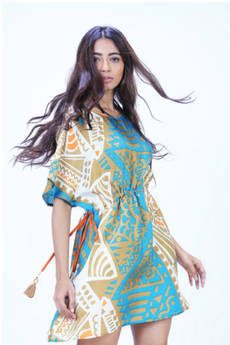
Ref: Hamal 01K Color: Khaki Sizes: S, M, L