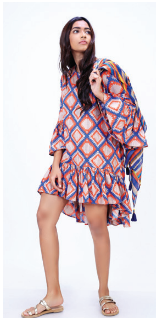
Ref: Aztec 01D Color: Orange Blue Sizes: S, M, L