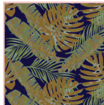
Ref : Chuchu 02J Color : Navy Size : S, M, L