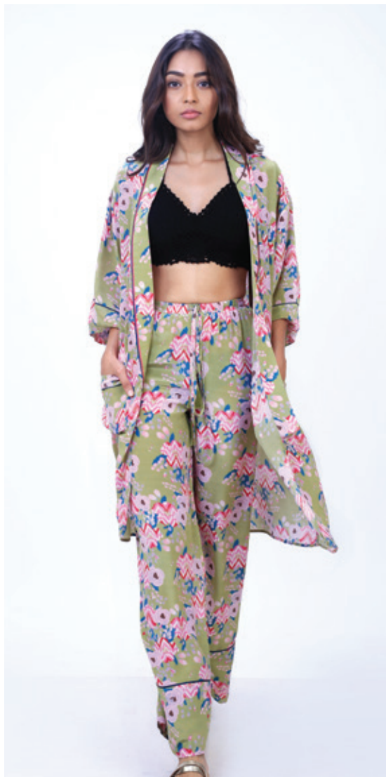
Kimono Pant Ref: Vintage Ref: Vintage Floral 01KM Floral 01P Color: Green Color: Green Sizes: Free Size Sizes: S, M, L