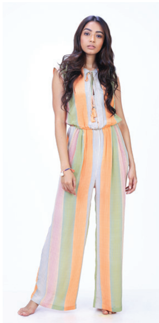
Ref: Rainbow 01J Color: Orange Sizes: S, M, L