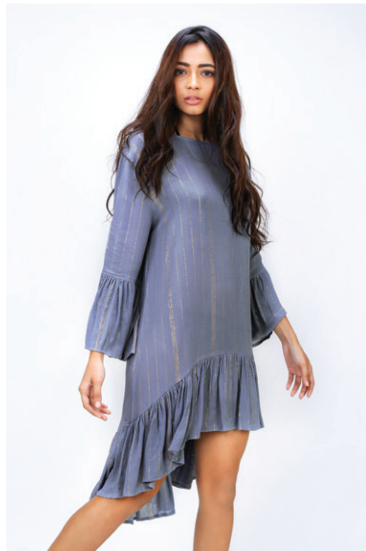
Ref: Lurex 04D Color: Pale Blue Sizes: S, M, L