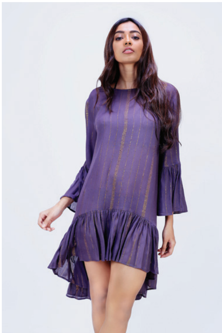
Ref: Lurex 05D Color: Purple Sizes: S, M, L