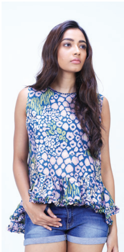
Ref: Leopard 01T Color: Lilac Sizes: S, M, L, XL