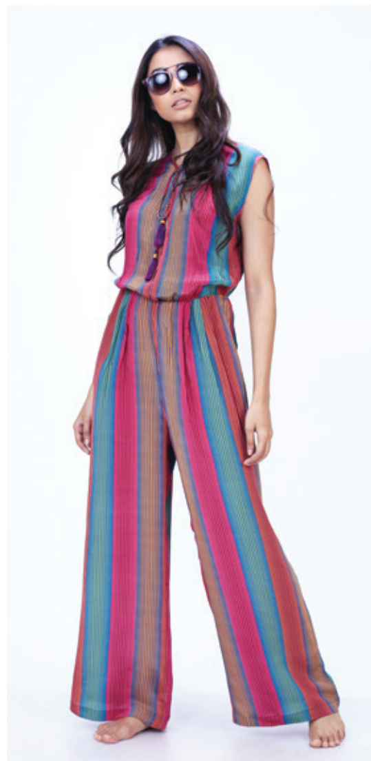
Ref: Rainbow 02J Color: Purple Sizes: S, M, L