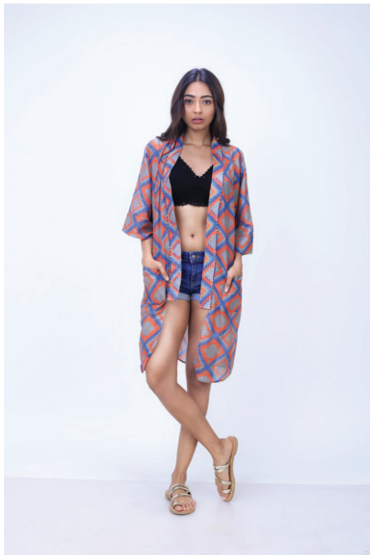
Ref: Aztec 01KM Color: Orange Blue Sizes: Free Size