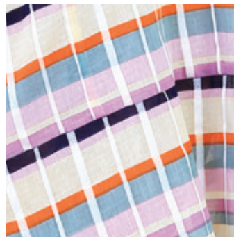
Ref: Stripe 02SK Color: Off-White Sizes: S, M, L