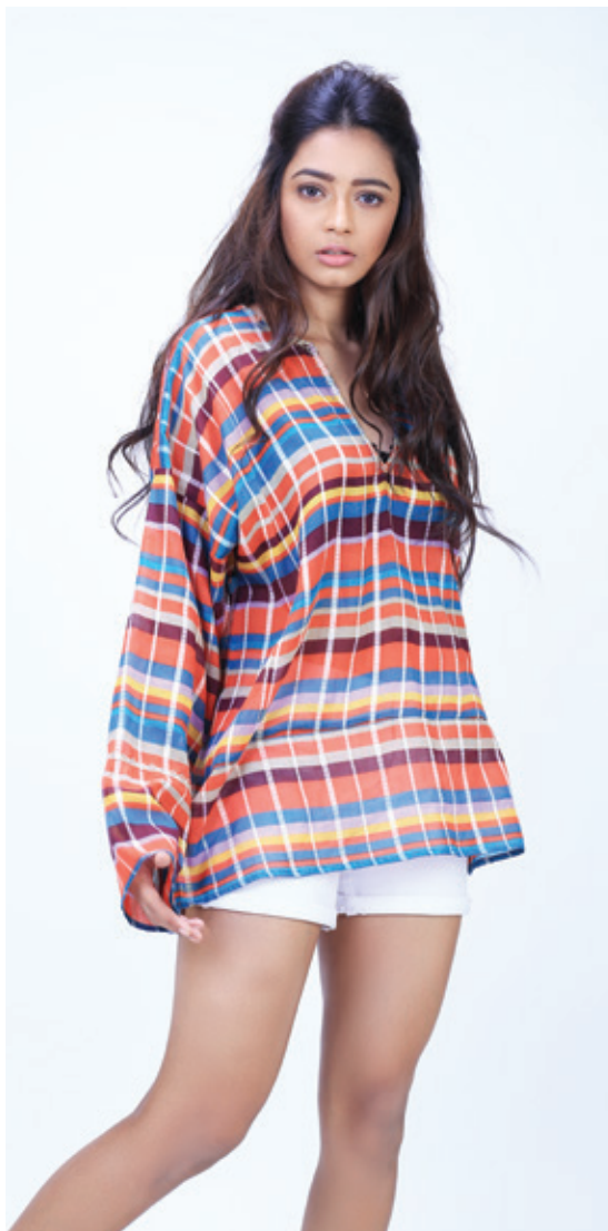
Ref: Stripe 04SK Color: Orange Sizes: S, M, L