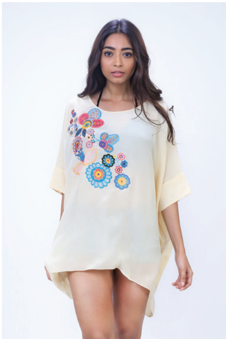
Ref: Orchid 02T Color: Ecru Sizes: S, M, L