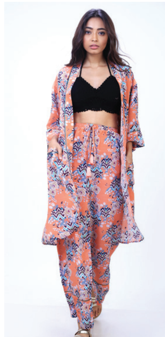
Kimono Pant Ref: Vintage Ref: Vintage Floral 02KM Floral 02P Color: Coral Color: Coral Sizes: Free Size Sizes: S, M, L