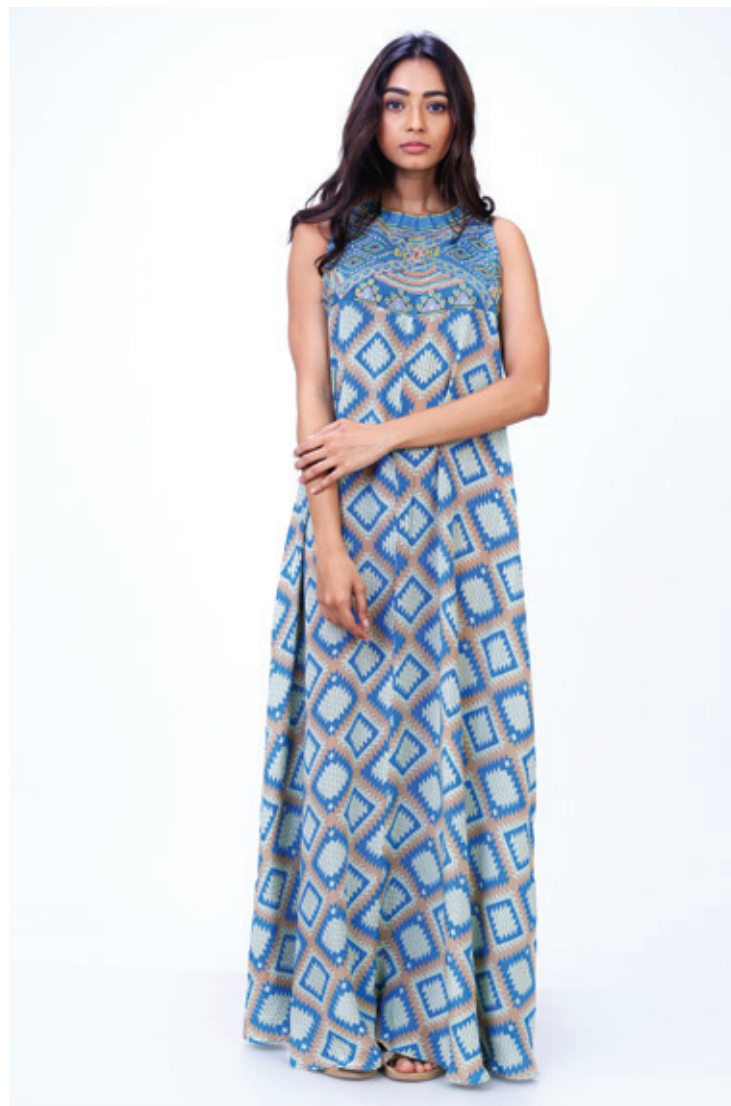
Ref: Aztec 03MD Color: Pale Blue Sizes: S, M, L