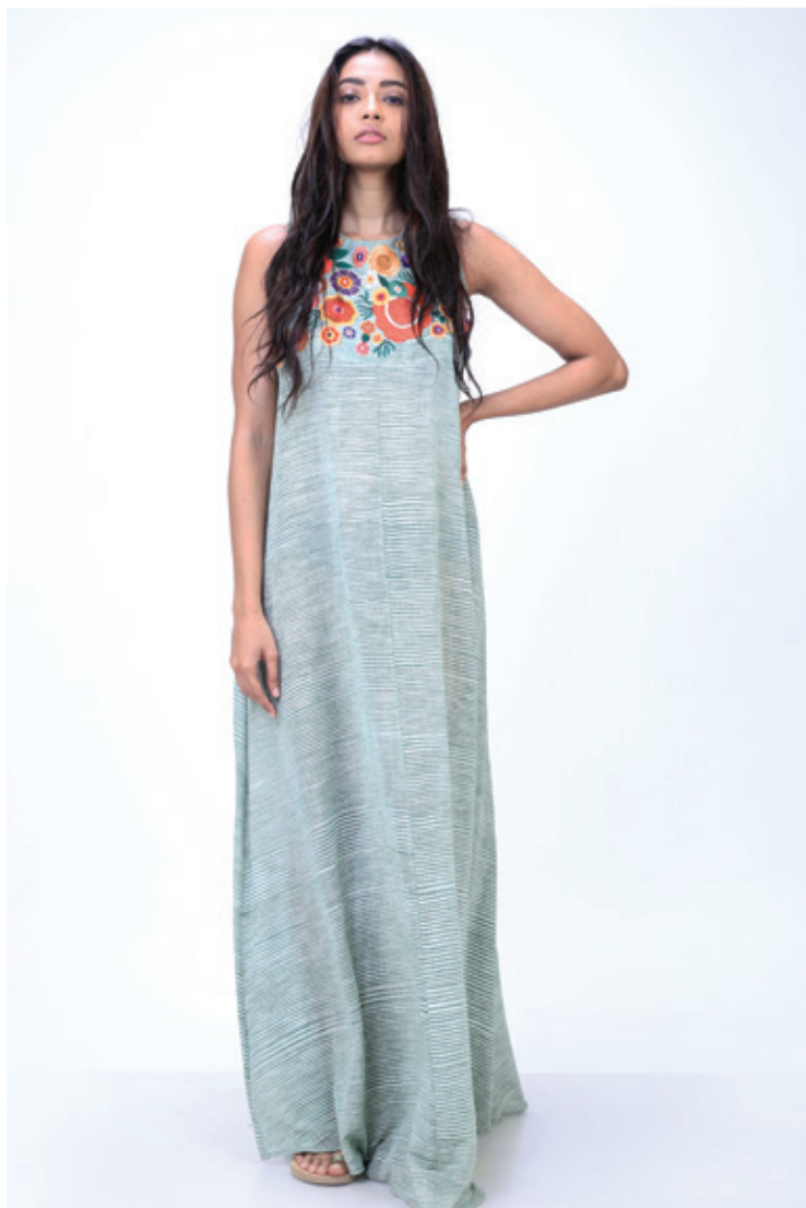
Ref: Ikat 02MD Color: Green Sizes: S, M, L