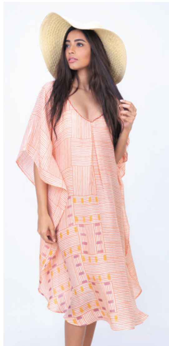
Ref: Block Tribal 01K Color: Rust Sizes: Free Size