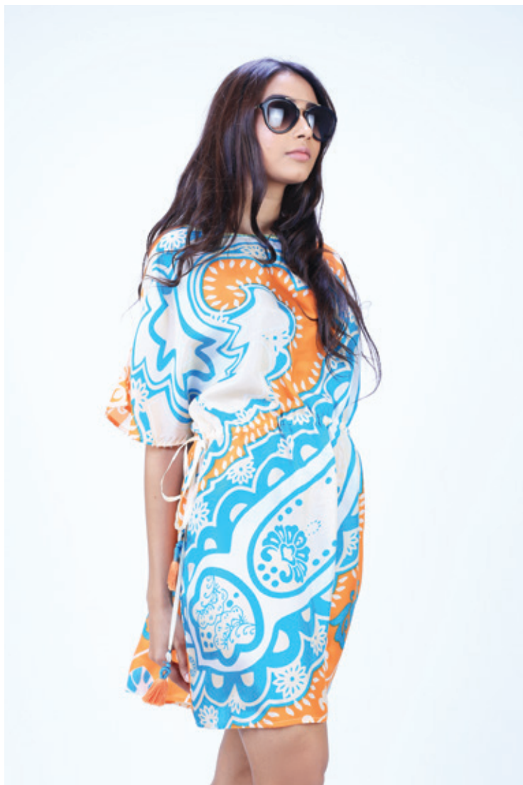
Ref: Jodha 01K Color: Orange Sizes: S, M, L