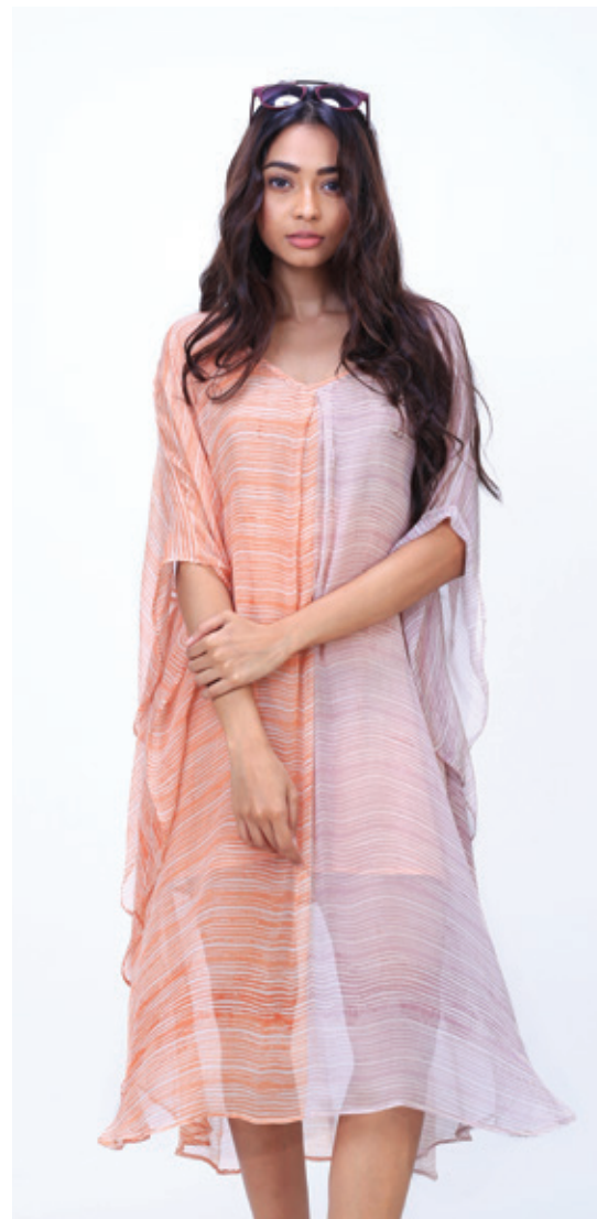
Ref: Block Stripes 02K Color: Rust Sizes: S, M, L