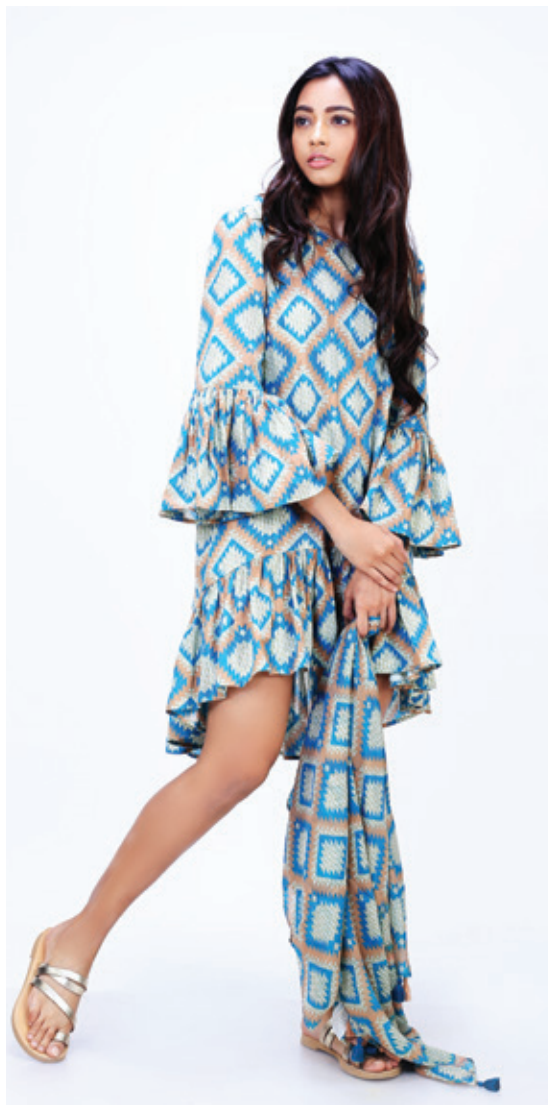
Ref: Aztec 03D Color: Pale Blue Sizes: S, M, L