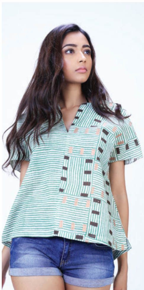
Ref: Block Tribal 03T Color: Green Sizes: S, M, L