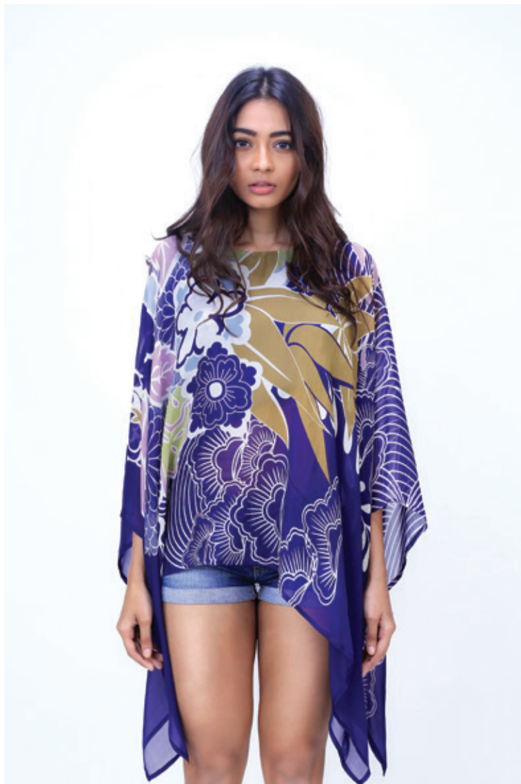
Ref: Meadow 03SP Color: Purple Sizes: S, M, L