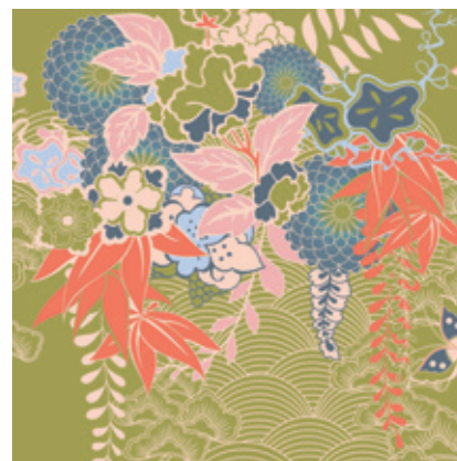
Ref: Meadow 01SP Color: Green Sizes: S, M, L