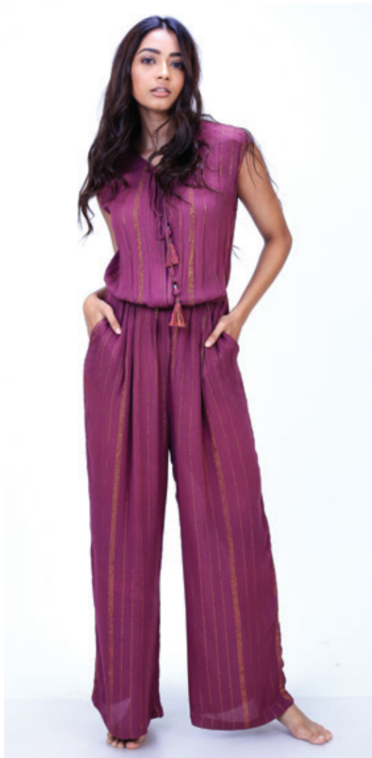
Ref: Lurex 03J Color: Purple Sizes: S, M, L