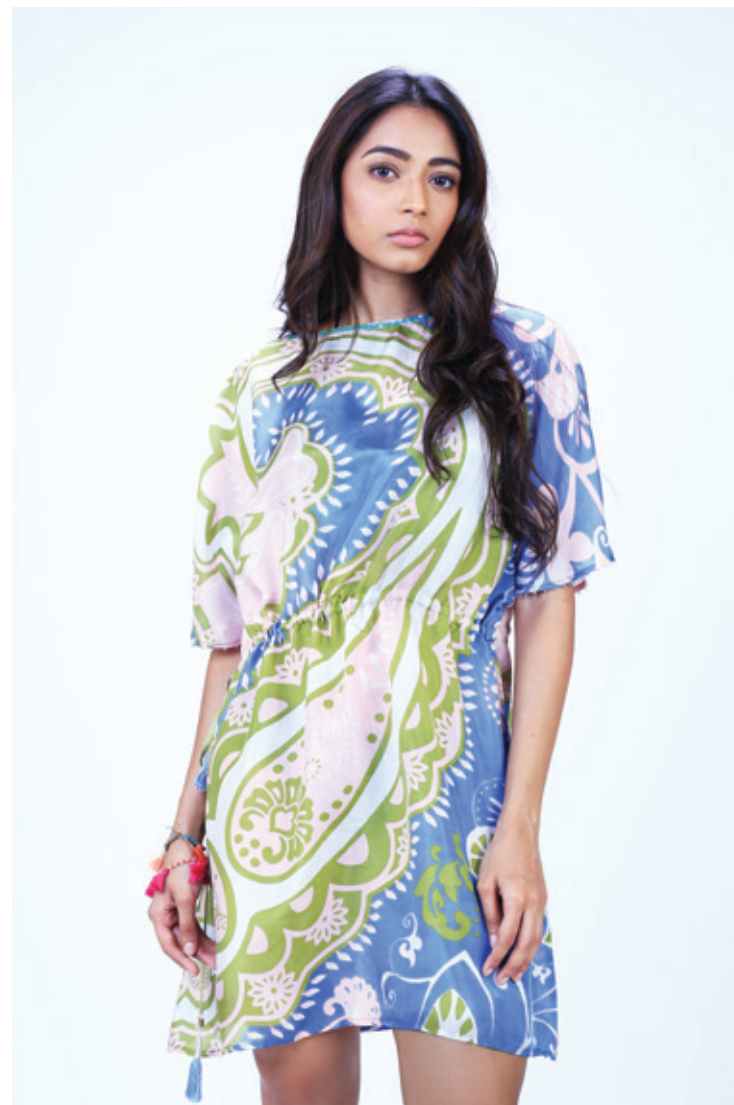
Ref: Jodha 03K Color: Pink Sizes: S, M, L