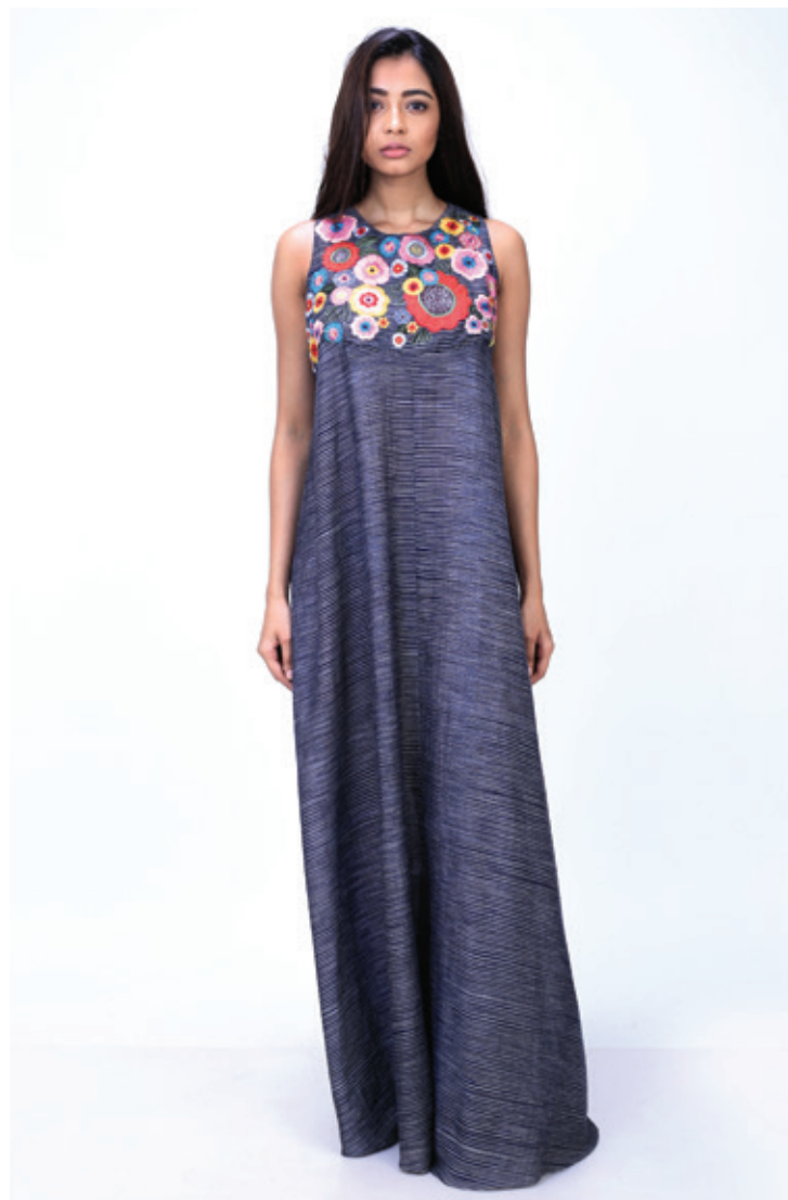
Ref: Ikat 01MD Color: Navy Sizes: S, M, L